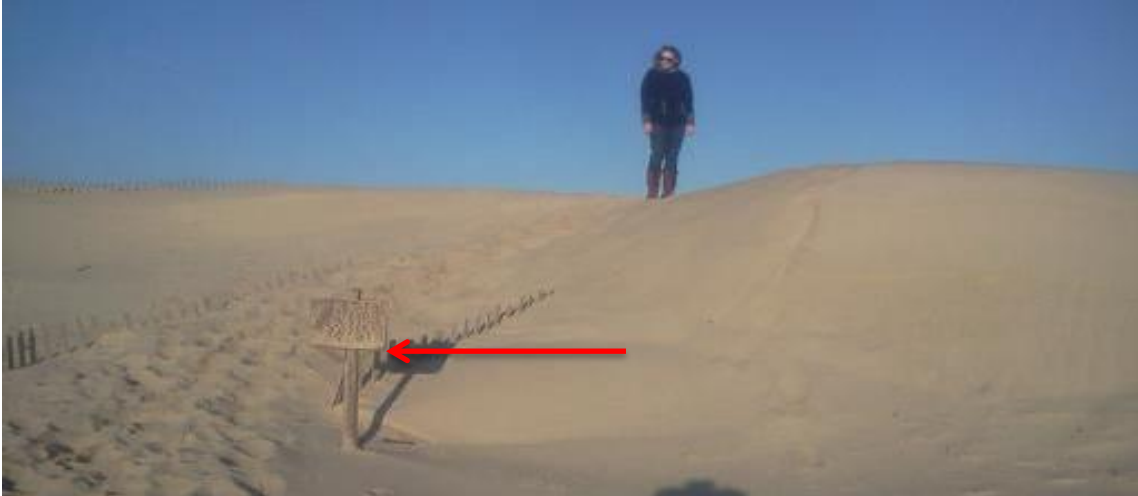
IMAGE BELOW EARLY WINTER. Sand continued to collect. Signpost from above image is nearly obscured, so we marked a new signpost on the dune crest.