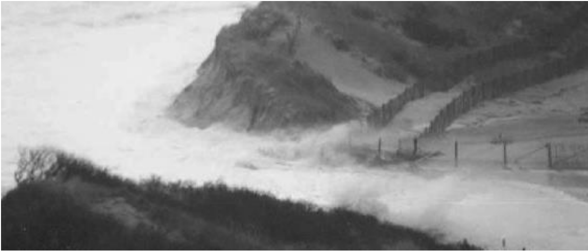
IMAGE BELOW Shows a more recent open breach, common to this dune system after 19 years of sand collection systems and pedestrian traffic control failed.

IMAGE BELOW 1991 “PERFECT STORM” waves over wash into freshwater marsh at the headwaters of Truro’s Pamet River and travel 1 mile down river.