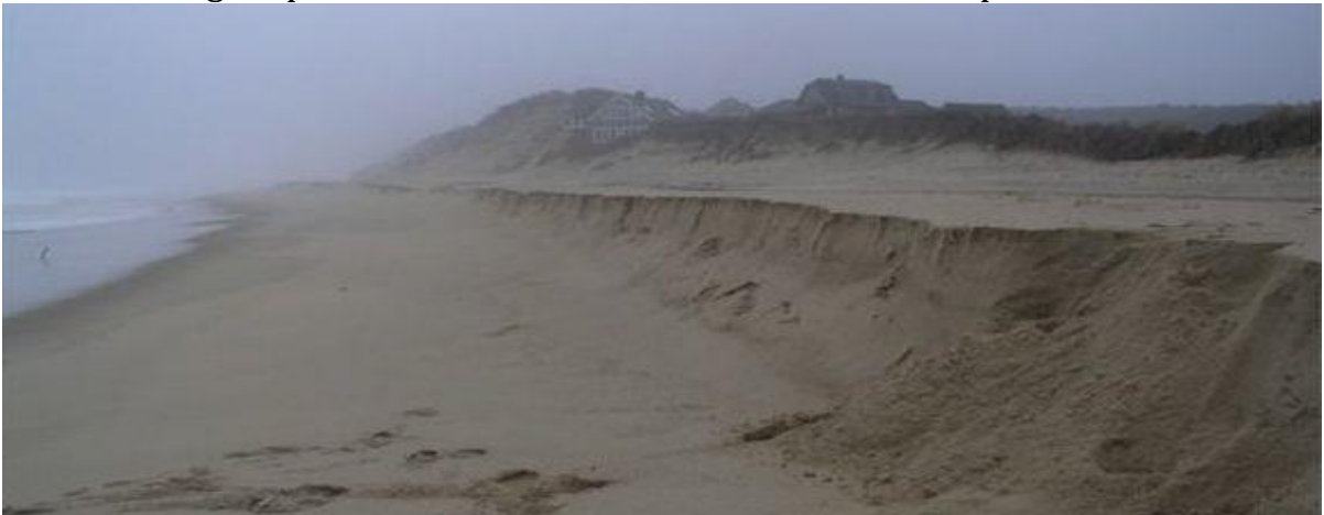
Storm winds create laminar flow, moving eroded sand down the beach.