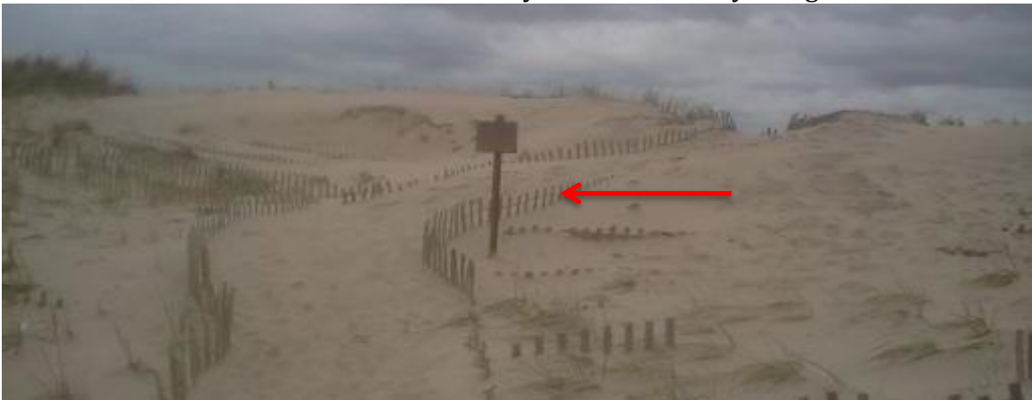
IMAGE BELOW DAY AFTER HURRICANE; setting shims for predicted Nor'easter. We were favoring the back-dune restoration area, as this is the most resilient area of a dune, where we wanted to collect a lot of sand.

IMAGE BELOW PRE-HURRICANE. The 2 nd year we were only using cedar shims.