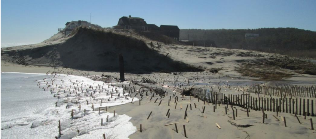
Image below documents Biomimicry sand collection from storm wave over wash.

Image below shows High Risk Biomimicry Configuration : A significant portion of shims have been installed with 90-degree offset, further reducing cross section.