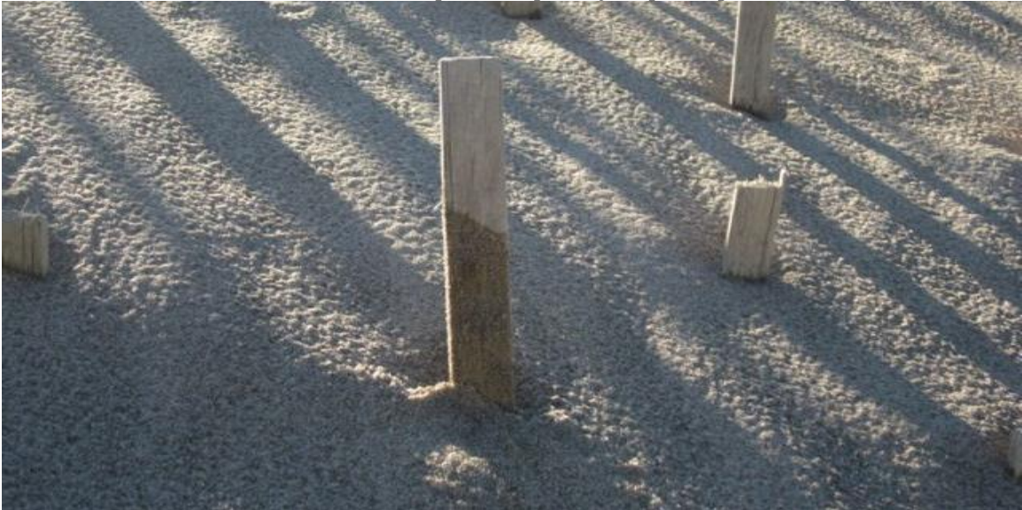
IMAGE BELOW PRE-HURRICANE. The 2 nd year we were only using cedar shims.

We discovered when the slats were pulled up, they kept on performing.