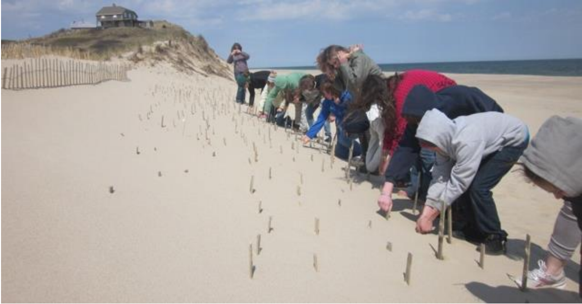
Erosion brings exponential volumes of sand into the coastal process.